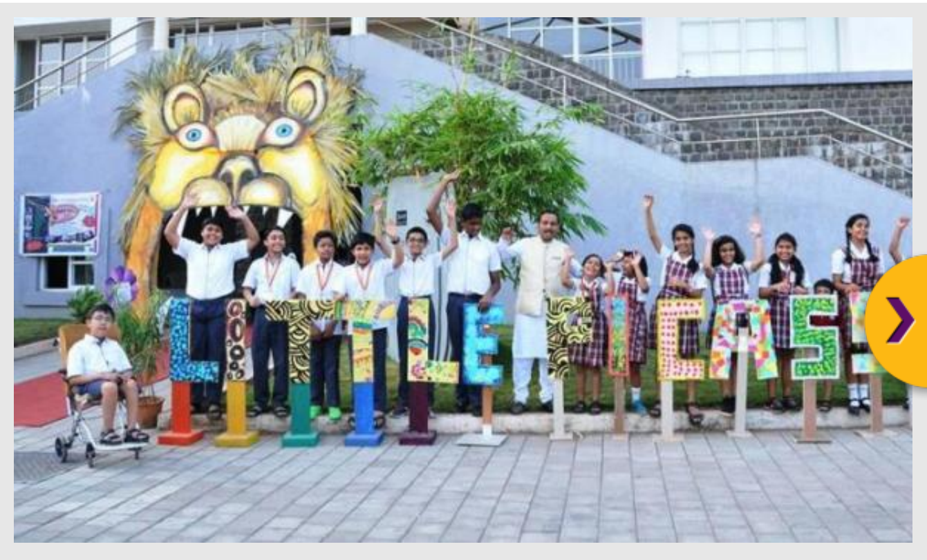
Students from pre-primary to 8th grade were part of this grand artistic fiesta.

The Somaiya School in Ghatkopar hosted an event 'Little Picasso Art Mela 2015' on Saturday to encourage the artistic expression amongst budding artists and students.