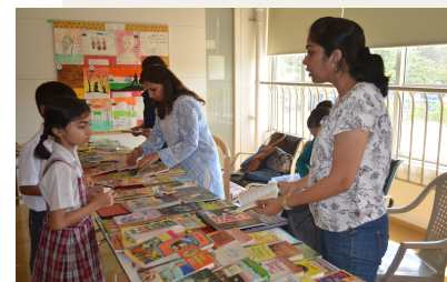
Used Books sales led by Parent Volunteers