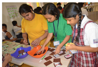
Game Stalls piqued the students' imagination