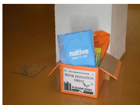
Book Donation Boxes placed across the campus