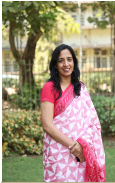
From the Principal's desk