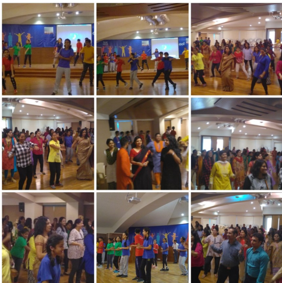
Dancing to the tunes of the students