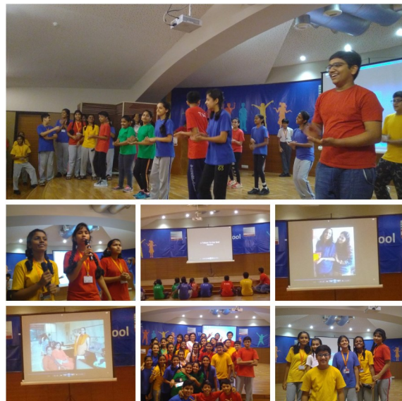
Enthusiastic student organisers