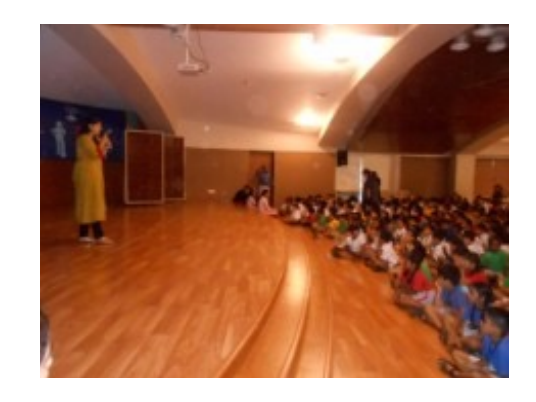
and preserve our nature for the benefit of mankind.

It is crucial to promote environmental awareness amongst students and teachers alike, especially at a time like this. At the school, the staff and students were part of an enlightened assembly session on environmental consciousness and preserve our planet for the future generations. We were all enlightened on the data presented in the seminar on carbon footprints, and steps were outlined on how we could reduce the same. Post the seminar, I vowed to myself to protect